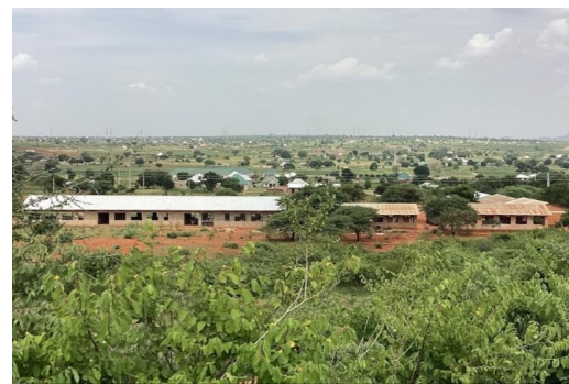
Zuzu Secondary School. This is how flat