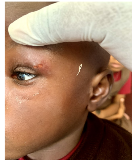
Child suffering from botfly

As in years past, First Lutheran members met the Choices in Mission $5000 matching fund's goal! Individual gifts adding up to $7960 brought our total donation to $12,960. Thank you so very much for supporting IHP-US in the work of bringing excellent healthcare to Tanzania! A Tanzanian proverb puts it this way: "The heart is that which gives. The fingers only let go." Thank you for your generous hearts. This will cover the cost of repairing existing equipment, and goes a long way toward the goal of replacing aging vehicles.